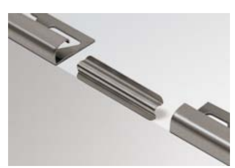
Schlüter®-RONDEC-E/V (Connector for stainless steel profiles)

ATGB = Brushed titanium anodised aluminium