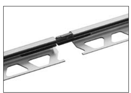
Schlüter®-RONDEC-A/V (Connector for aluminium profiles)

Colours: TSB = tuscan beige aluminium, TSG = tuscan pewter aluminium, TSOB = tuscan bronze aluminium